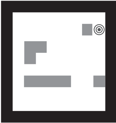
Figure 1. A typical room in the game. Gray squares are internal obstacles and the bull's eye is the treasure location.

Following the trend of some previous works, ours was also inspired by semiotics. However, unlike authors who have resorted to fundamental semiotic theories, we have used Semiotic Engineering 1 , a theory of Human-Computer Interaction with semiotic foundations stemming mainly from the work of Peirce 34 and Eco 12 .