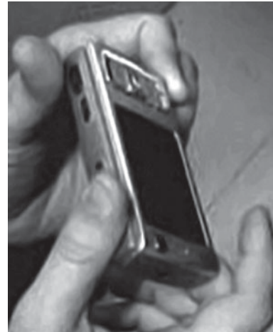
Figure 4. Manipulating the phone in unexpected ways.

The game was so designed that when a player finds the treasure, the game starts over again. The game plays the opening door sound again to communicate this event.